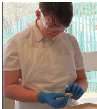
The Medical School students dissecting an eye. Thanks to the PTFA for supporting this.

It is great to see the re-introduction of after school and lunchtime clubs. We all know the importance of the holistic experience of school we are able to provide.